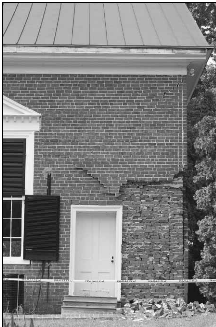
Some of the damage sustained at Gilboa Christian Church.

On August 23, 2011, a 5.8 magnitude earthquake struck about five miles from Mineral, Virginia, in Louisa County. The earthquake was felt across a dozen Eastern states. Three Disciples churches in the area sustained damage from the event. The epicenter of the earthquake was approximately a mile from historic Gilboa Christian Church in Cuckoo, Virginia, and its sanctuary was rendered unusable. While the floors and the roof can be saved, everything