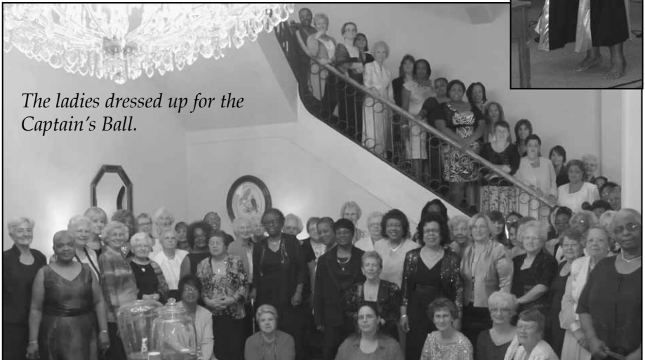
The ladies dressed up for the Captain's Ball.