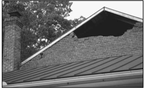
More earthquake damage: a hole in the back wall of the sanctuary of Gilboa CC.